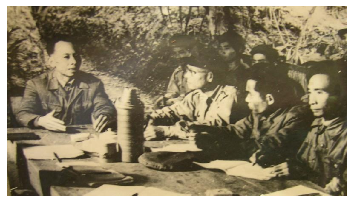
Photo 2 : Khamtay Siphandon chairs an administration meeting in a cave shelter in Vieng Xay, Houaphan Province, during the American War period (LNTA 2014)

Caves continue to be identified as important places for various ethnic groups in the Lao PDR and some ethnic groups have been reported to incorporate caves and karst within cosmological belief structures and mythical narratives. In Savannakhet Province, some caves provide a residence or locality for ancestral and forest spirits of some Mon-Khmer language-speaking groups. Ancestral and other spirits often reside in caves and also live in forests, mountains and rice fields. These spirits are regarded by ethnic Brou people as 'guardians' of the places and function as 'protectors' of local clan groups. Spirits that reside in caves are called upon for ceremonies throughout the lunar and agrarian calendar year. Villagers propitiate spirits regularly to keep their families and their villages healthy and their crops prosperous (Chamberlain 2007; 2010). In Luang Namtha Province, the Vieng Phouka karst is the location of an annual ceremony in January in which a local shaman entices large fish from the cave to provide a feast for those present at the ritual (Kiernan 2009).