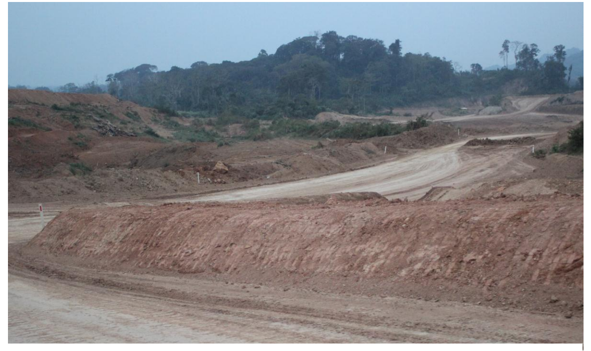
Photo 11: Mining haul roads encroaching on Tham Bing (top and center of picture) in Savannahket Province. A forested buffer-zone has been implemented to safeguard the natural and cultural values of the cave from mining-based impacts

In light of the view that many caves are 'living places,' pro-poor and community-based tourism projects are currently an alternative that is arguably more sustainable for communities and the environment than is mining, logging and dam construction. It is possible to promote tourism while achieving environmental protection and sustainable economic benefits in remote communities. Nonetheless,