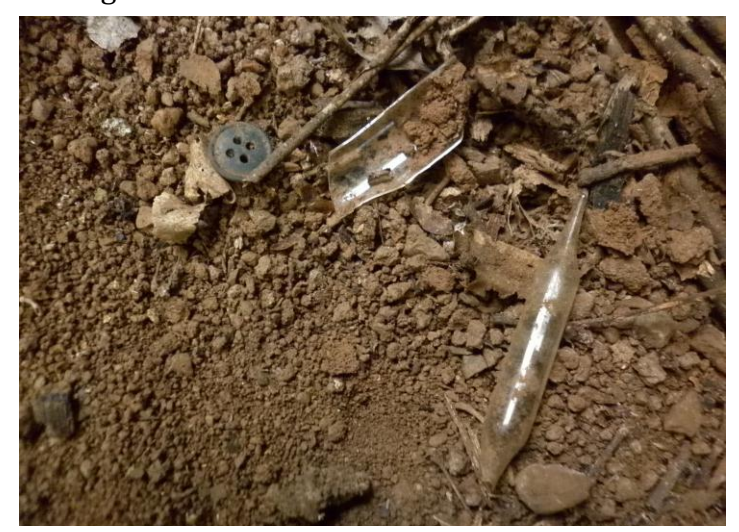
Photo 8: Material residue from cave use during the American War period. These include a broken glass syringe and a button from a military uniform. Tham Pakou , Savannakhet Province

damage or degradation (Day 2011; Day and Urich 2000; Kiernan 2009; 2011; 2013; Lyttleton and Allcock 2002). When assessing its role, it can also be argued that heritage legislation and the use of heritage practices are part of nationwide social economic development initiatives (Sourya et al. 2005). This generates three questions: Why is heritage managed and protected? For what is heritage managed and protected? Who decides what type heritage is managed and protected?