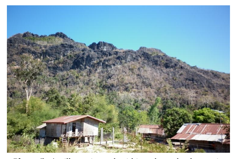
Photo 5: A village situated within a karst landscape in Khammouane Province

recognized for providing human populations with suitable environments for growing wet rice and for swidden cultivation, and in general, karst provides wild food resources and supports intermittent seasonal occupation for hunting and gathering purposes (Kiernan 2011) (see Photo 5). Caves and karst areas associated