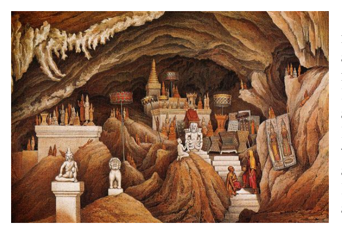
Photo 1 : De Lagree and Sorrieu's 19<sup>th</sup> century representation of the interior of Tham Nam Hou , located near Luang Phrabang (De Lagree and Sorrieu, in Garnier 1873).

Caves and karst were first recorded by French cartographers and explorers in the course of their mapping and mineral exploration of French Indochina during the 19th and early 20th century. In the Luang Phrabang region, Tham Nam Hou was described by Francis Garnier sketched by Doudart De and Lagree (see Photo 1), the leaders of a French team that explored the Mekong River catchment between Saigon and the southern Chinese province of Yunnan between 1866 and 1868 (Garnier 1873). Caves in the Khammouane region were