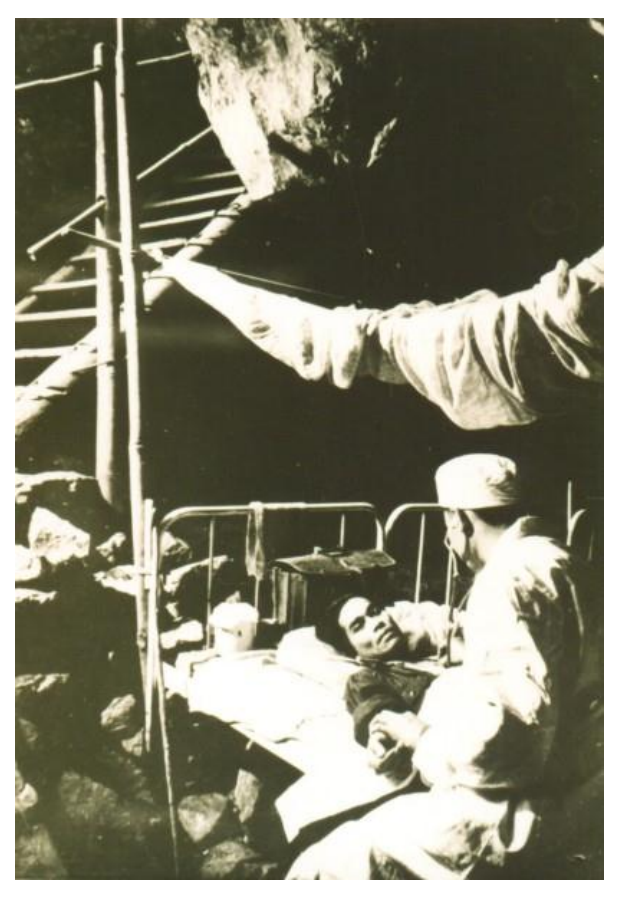
Photo 4: Caves in Vieng Xai also provided medical services for civilians and soldiers during the American War period (LNTA 2014)

Cave and karst environments have played an important role in local economic and subsistence activities for many rural people in the Lao PDR, and were important places in prehistoric and hunter-gatherer lifeways (Higham 2012). Karst water catchments are