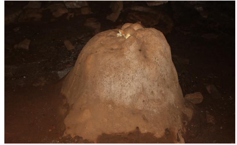
Photo 9: An offering of rice on a cave stalagmite made by local villagers to ancestral spirits. Tham Pakou, Savannakhet Province