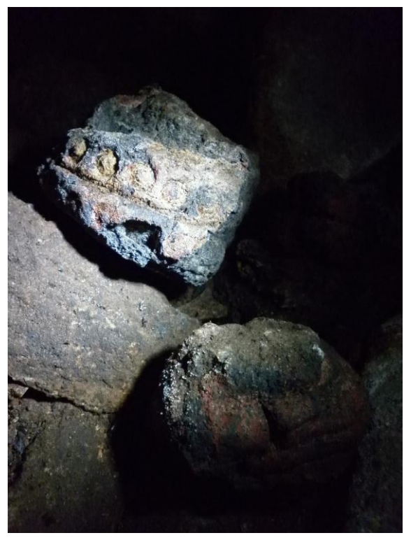
Photo 7: Decaying ancient wooden statues of the Buddha in a natural shrine at the rear of Tham Pakou , Savannahket Province

The variety of uses for and values represented by caves and karst to some extent meet all of the categories required national heritage protection, for including natural heritage, historical heritage, and tangible and intangible cultural heritage. The Lao Law on National Heritage, introduced in 2005, provides the legislative framework for the protection of natural, cultural and historical heritage nationwide, recognizing significance on local, national or international levels (National Assembly 2005). Even though there is a provision for this within Lao heritage legislation, a low percentage of caves and karst are identified and protected nationwide, including in existing heritage management frameworks. Further, heritage management irregularly plans for or promotes multi-heritage uses and values of caves or karst. As has been identified by other research, when heritage values in caves or karst are not identified or managed appropriately, cave and karst environments and heritage values become at risk for